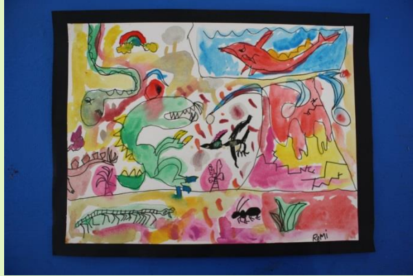
'Face' by Lyra, 'Dinosaur' by Remi